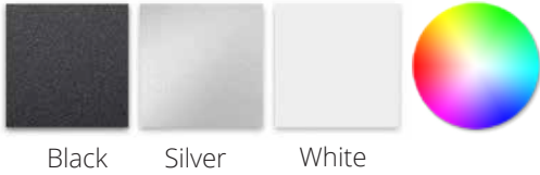
Black Silver White

Custom Pantone Matching Available Full Color Lexan Laminated Graphics Available